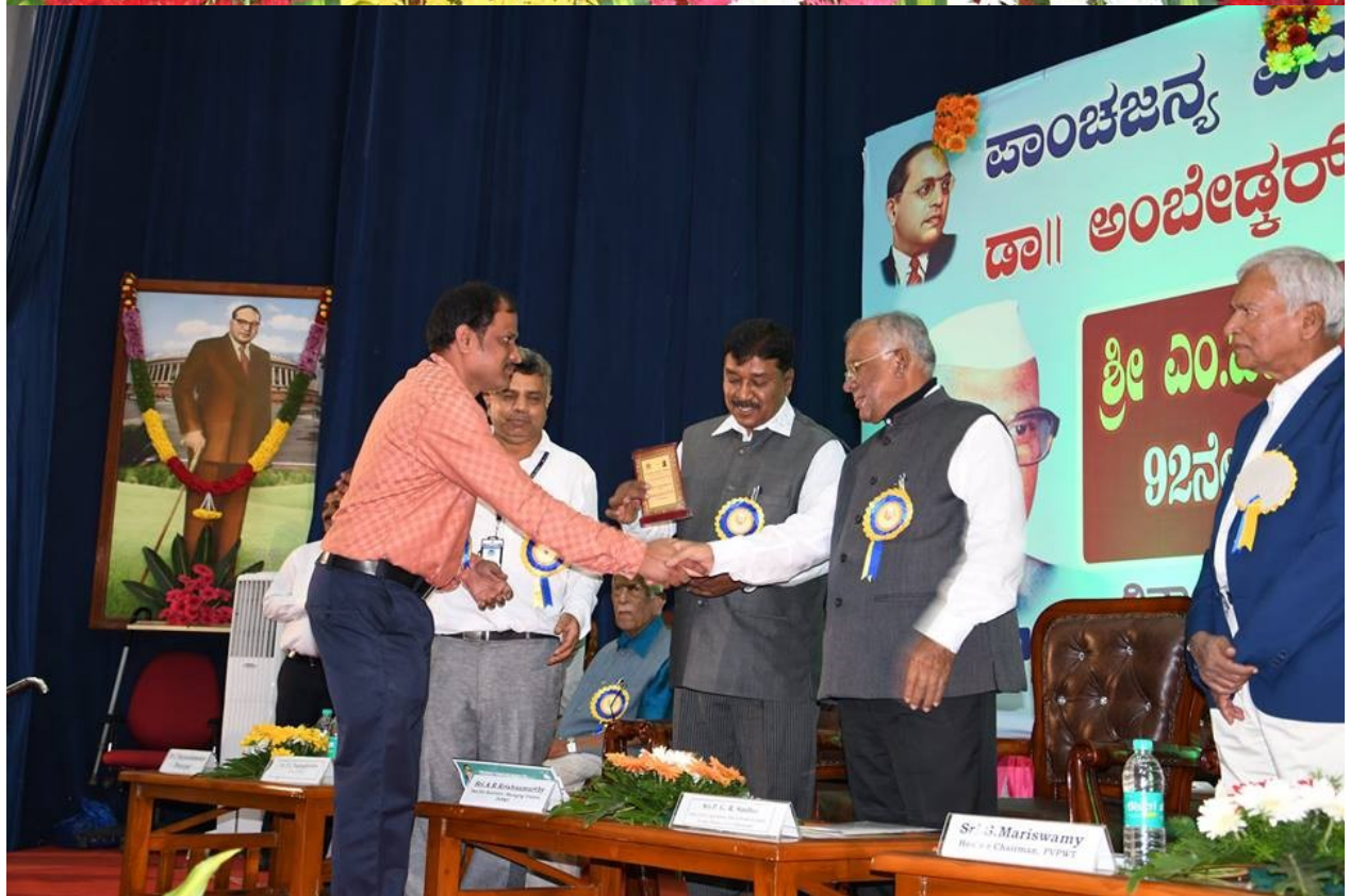
Releasing the Calendar & Diary and distributing Prizes