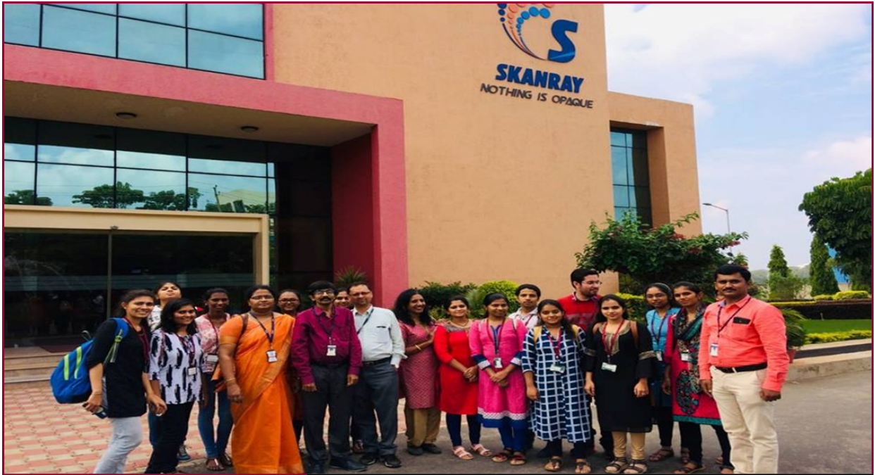
Technical Talk on Patient Safety