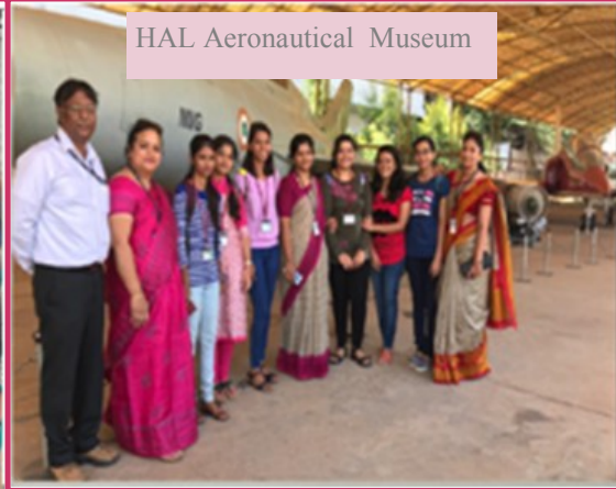
HAL Aeronautical Museum